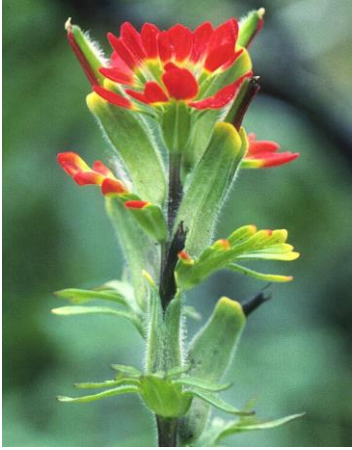
Mark Egger Castilleja zempoaltepetlensis

many species in the genus that are rare and declining due to a variety of causes, as well as many others that are extremely range-limited due to their stringent habitat requirements. Many of these species are seriously threatened with extinction from a variety of mostly human-caused factors, including global warming and resultant climate changes.