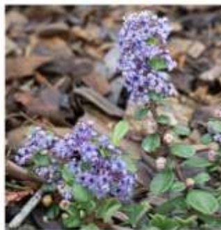
Valley Violet Ceanothus