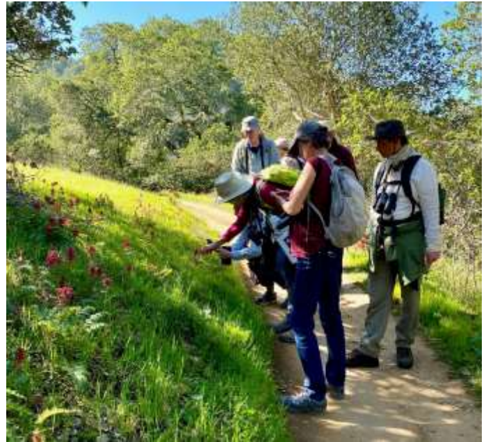
Friends of Edgewood Friends of Edgewood docents examine warrior's plume ( Pedicularis densiflora ) on a spring wildflower hike, April 2022

have questions about the hikes, please email info@friendsofedgeswood.org .