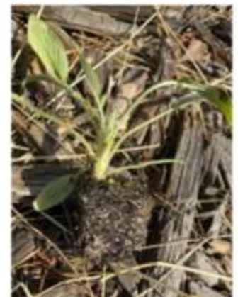
CA Phacelia from Plug Tray

FREE Xerces Pollinator and Habitat Kits, used to help start Cataldi and Kirk Park native gardens. See next page to learn more.