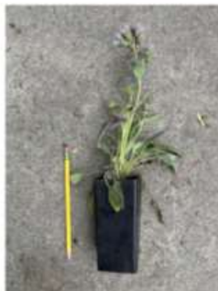
CA Phacelia in Tree Band