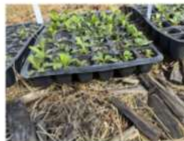
Tray of Plant Plugs in Grassland Kit