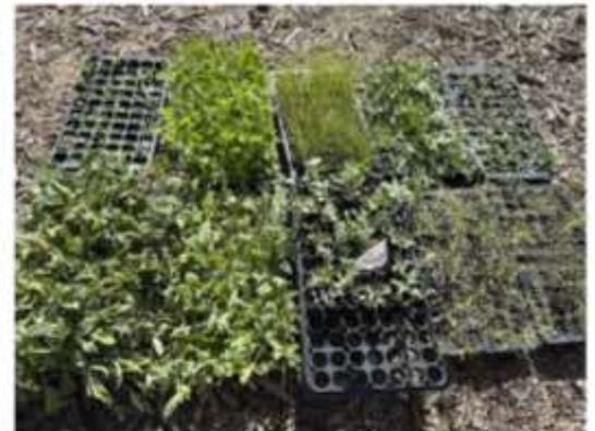
One Grassland Kit