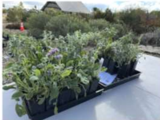
Two Garden Kits

Workdays are usually held at 9:00am on Saturdays . If you're interested in volunteering, check the dates and sign