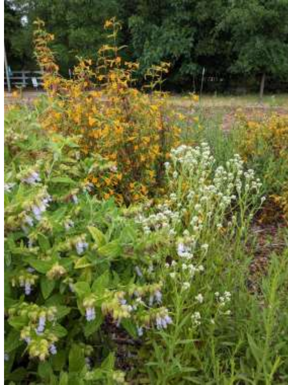
Grassroots Ecology Native perennials at McClellan Ranch Preserve dripping with flowers after only two years!

Grassroots Ecology is a nonprofit organization dedicated to caring for public lands and waters across Santa Clara and San Mateo Counties. In collaboration with public